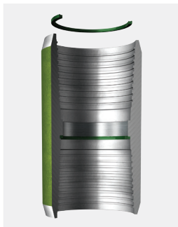
TSH WEDGE 563-CB